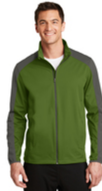
J718 Port Authority® Active Colorblock Soft Shell Jacket