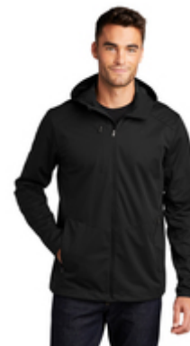
J719 Port Authority® Active Hooded Soft Shell Jacket