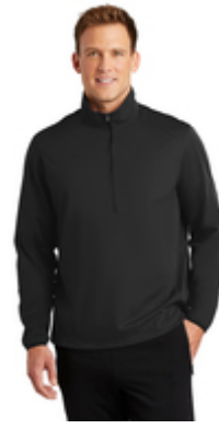
J716 Port Authority® Active 1/2-Zip Soft Shell Jacket