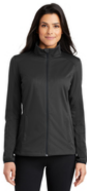
L717 Port Authority® Ladies Active Soft Shell Jacket