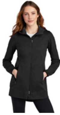
L719 Port Authority® Ladies Active Hooded Soft Shell Jacket