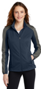
L718 Port Authority® Ladies Active Colorblock Soft Shell Jacket